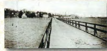
5 BRIDGE OVER THE CREEK