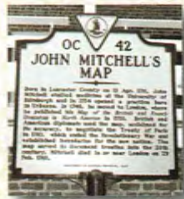
S4 JOHN MITCHELL'S MAP