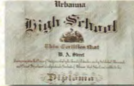
9 URBANNA SCHOOL