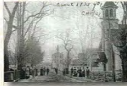
3 WATLING STREET AND URBANNA'S MASTER BUILDER