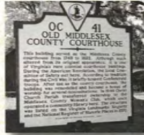
S3 OLD MIDDLESEX COUNTY COURTHOUSE