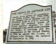
S1 THE GRAVE OF ARTHUR LEE