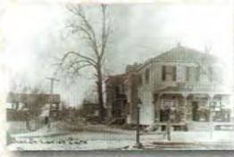
2 CROSS STREET