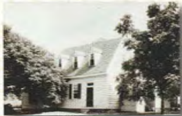
7 WORMELEY-LEE-MONTAGUE HOUSE AND MARBLE HOUSE