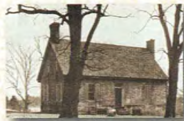
12 TOBACCO ROAD