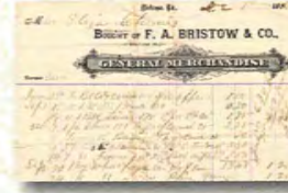
6 PRINCE GEORGE STREET AND OLD TAVERN