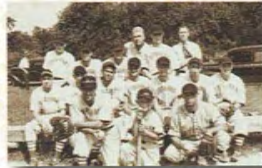
8 URBANNA BASEBALL