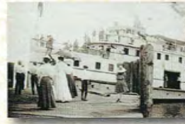
4 STEAMBOAT ERA