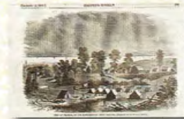
14 CIVIL WAR