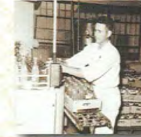
10 COCA-COLA BOTTLING PLANT