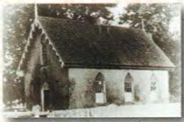
1 COLONIAL COURTHOUSE