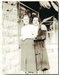
11 VIRGINIA STREET