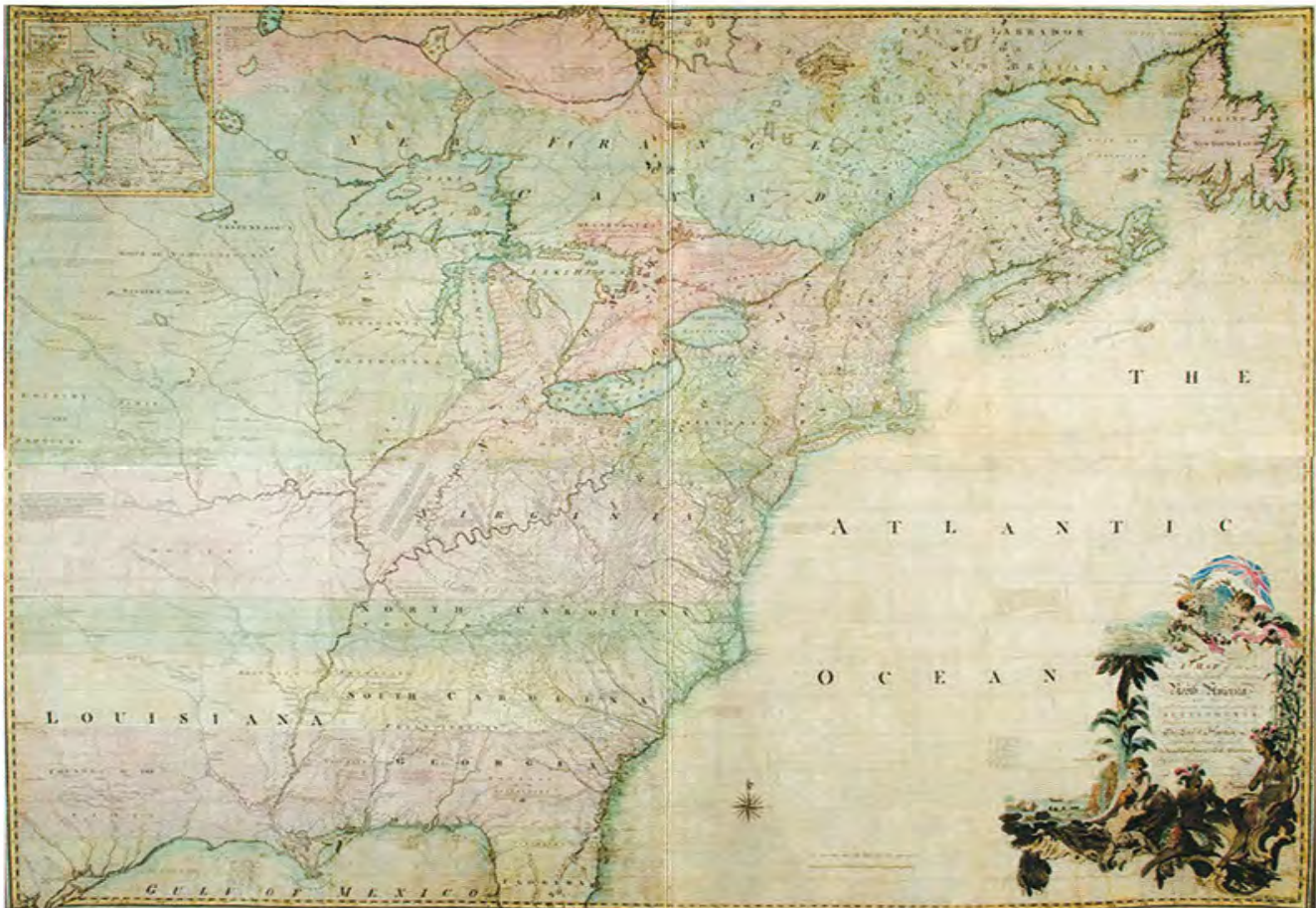
John Mitchell Map circa 1755 ~ First Edition, 3rd Impression

A second edition was published in 1757, followed by others, each adding information as it was learned. Mitchell's map was the only map used during the Treaty